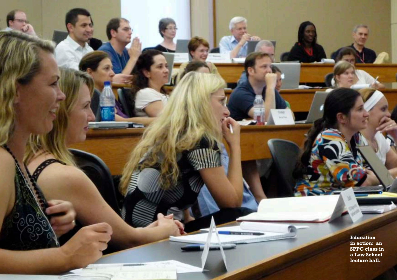
Education in action: an SPPC class in a Law School lecture hall.